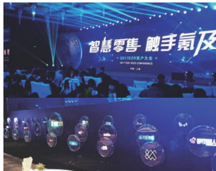
Show Retailers and Brands logo (2017 Shanghai Wisdom Retail Conference)