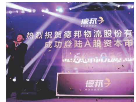
Applications on major celebration ceremony (Debon Logistics A-share Listed)