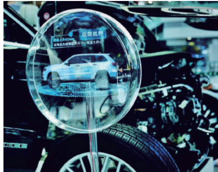
Automobile Structure Show (JEEP Capital Airport)