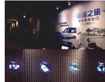
Show a Test Drive Car (Gac Kei Five Cities Drive New Round Trip)