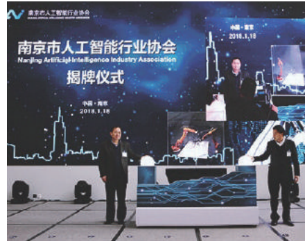
Launch Ceremony (Nanjing Artificial Intelligence Industry Association Meeting)