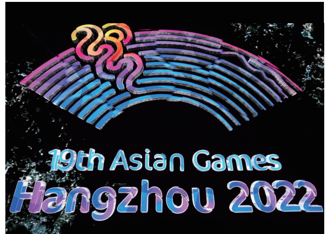
66pcs of SH-65 devices connecting screen scheme (Hangzhou 2022 19th Asian Games emblem release ceremony)