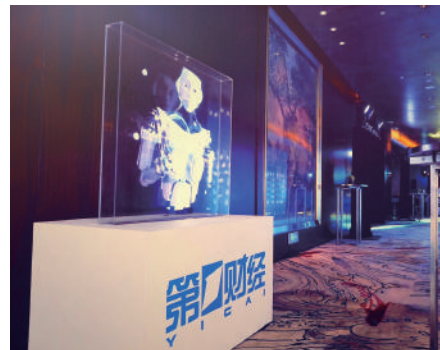
Show Products and Corporate Image (The First Finance and Economics)