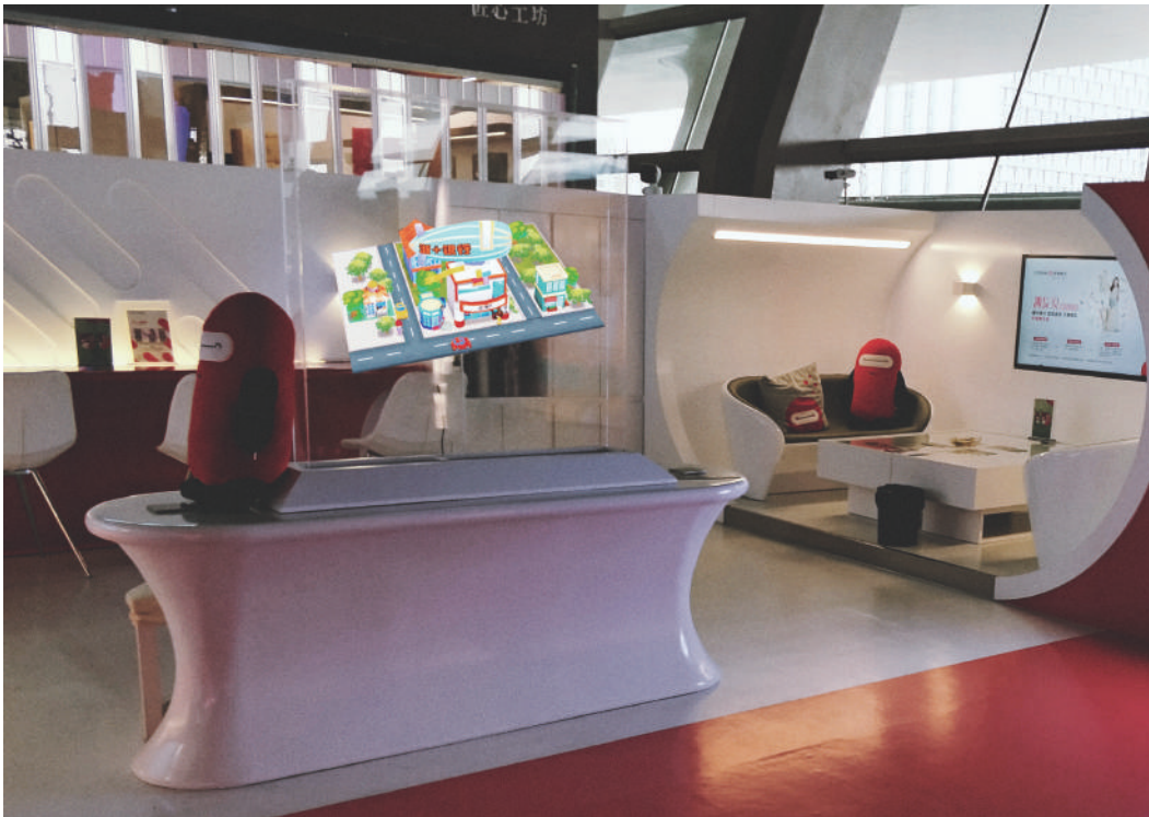
SH-100 (Zhesang Bank Interactive Experience Pavilion)