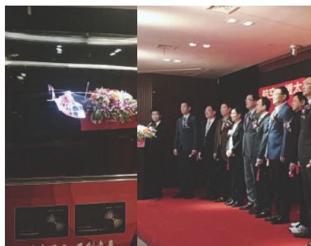
Launch Ceremony (China's Peace and Jinhui Navigation Air 120 Exclusive Service)