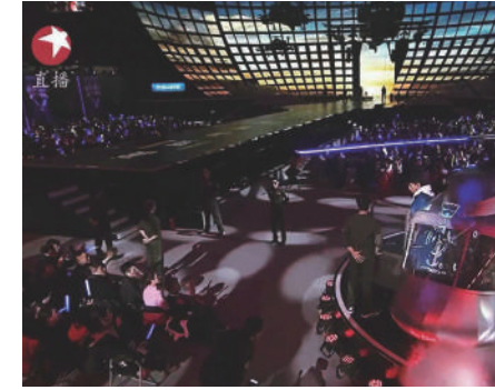
SH-100 device application in beautiful dancing scene 2018 Eastern TV Across New Year