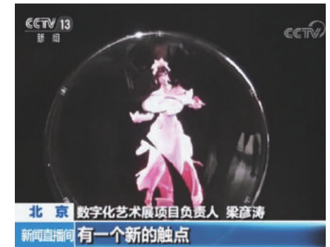
show the image of Du Linliang in traditional opera The Peony Pavilion (Tencent Video Palace Digital Exhibition Hall)