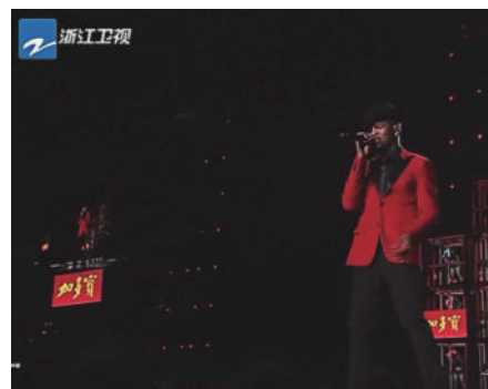
Handheld Superbholo dancer SH-56 device to perform 2018 zhejiang satellite TV New Year