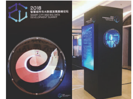
Wisdom City Concept (Wisdom City with Big Data Development Peak BBS)